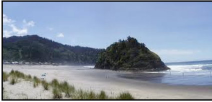
Neskowin Beach, Oregon Coast